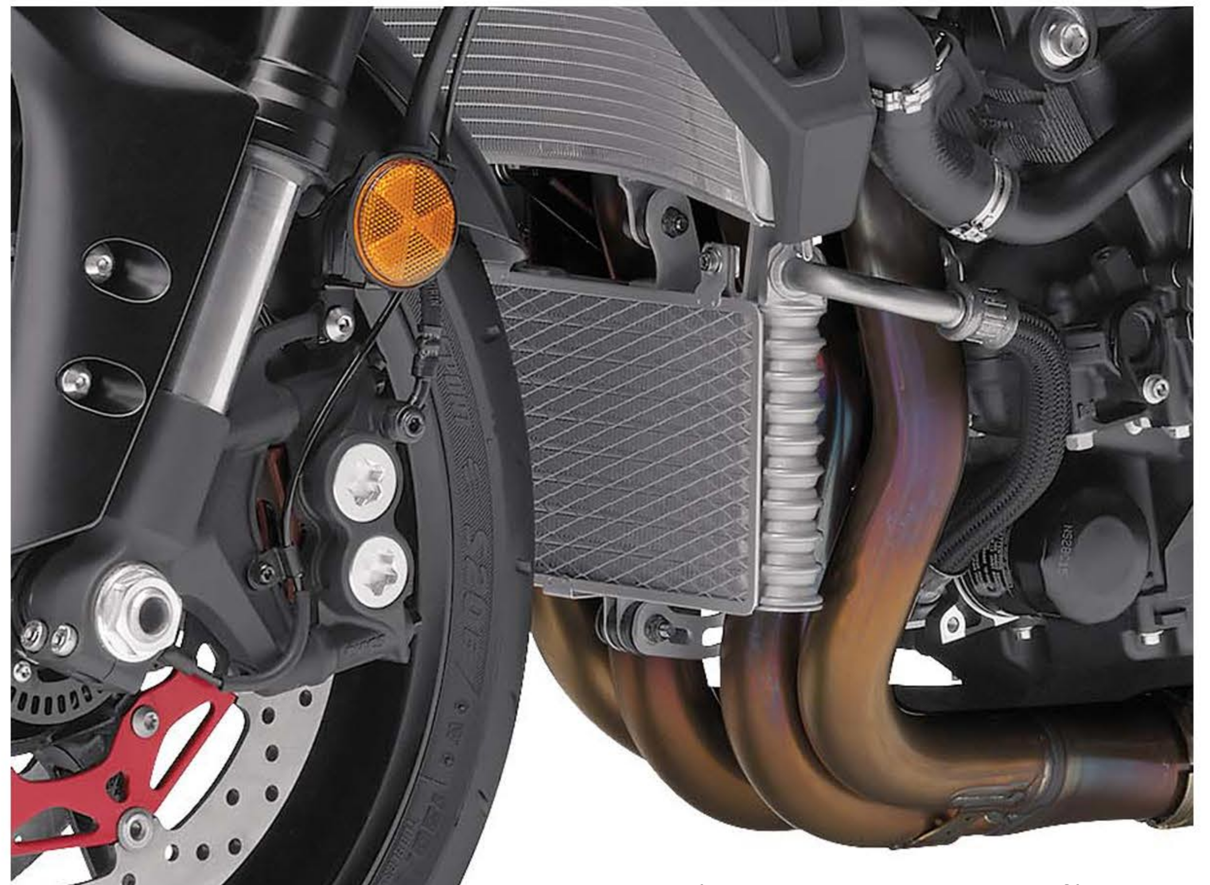
OEM Oil Cooler Guard fitted