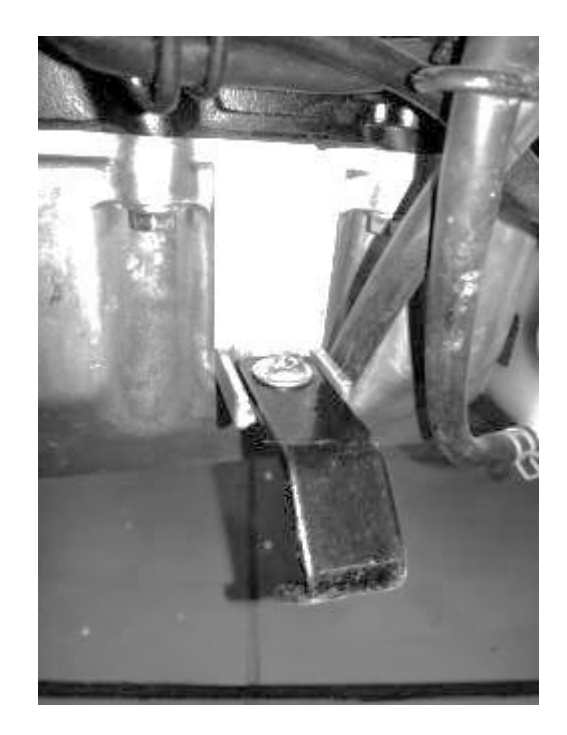
Finally take the belly pan and fit it to the bike.