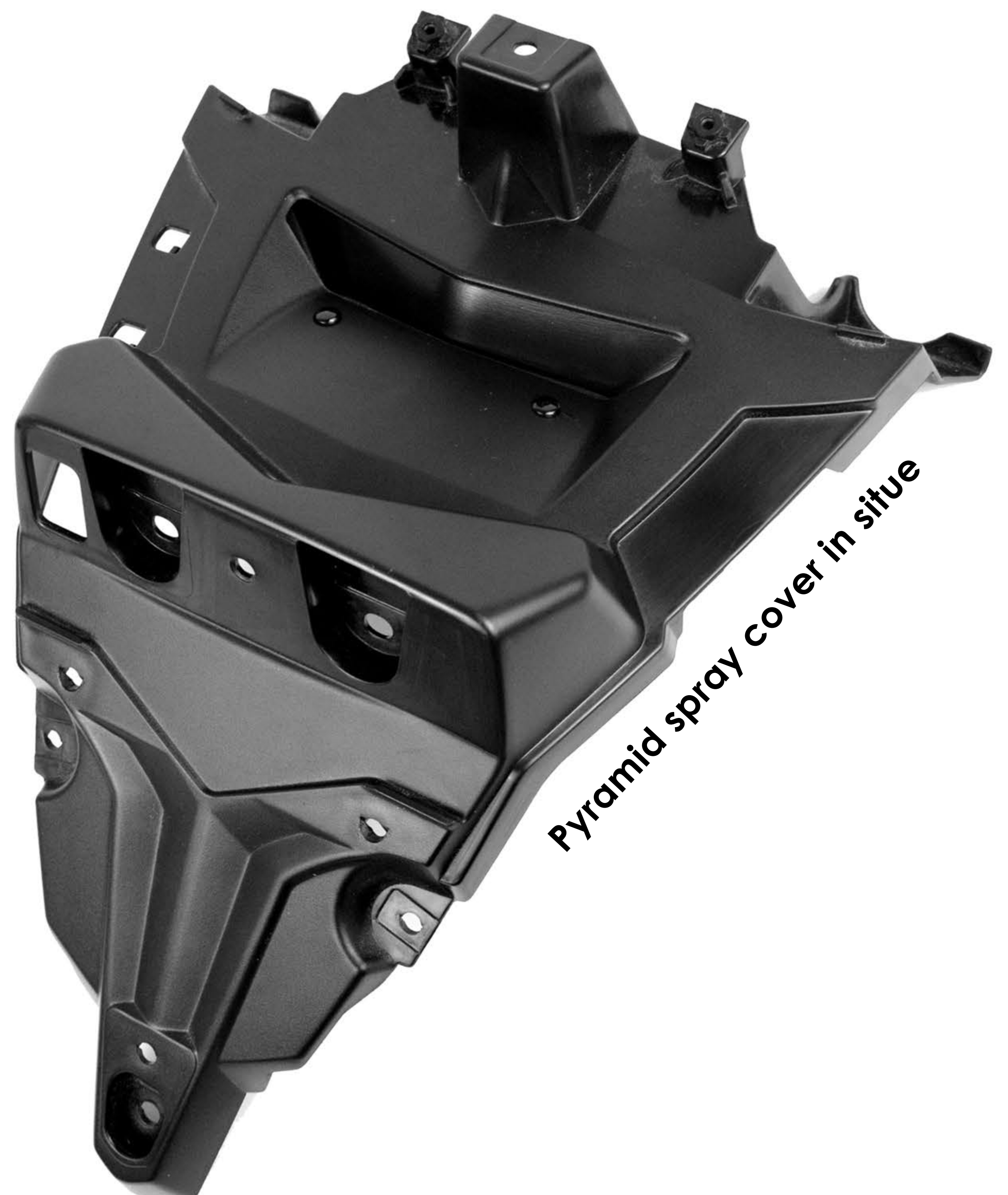
Pyramid spray cover in situ

Any questions? sales@pyramid-plastics.co.uk +44 (0)1427 677990 www.pyramid-plastics.co.uk