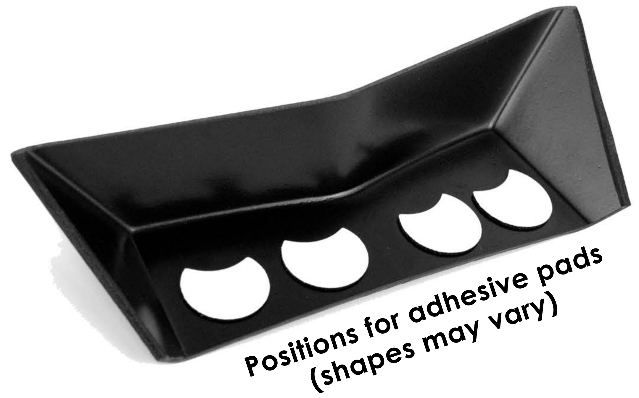
Positions for adhesive pads (shapes may vary)