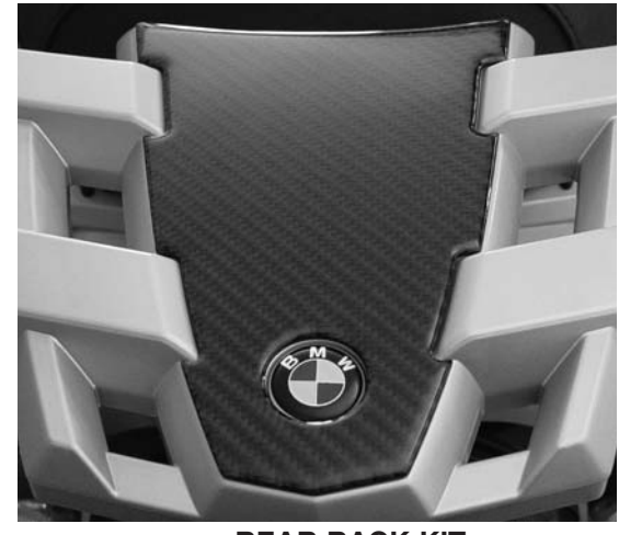
REAR RACK KIT Z8941